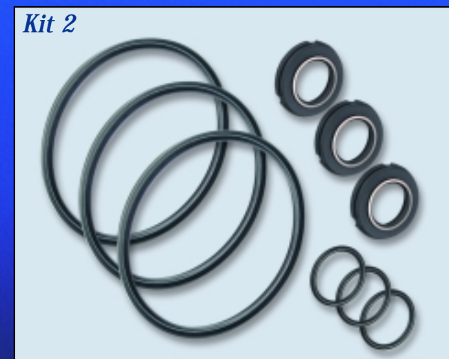
Casing Gaskets, Carbons, O-Rings