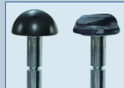
Metal detectable elastomers, if worn or broken off, can now be easily identified with in-line metal detection.

Detectables are available in buna, EPDM, FKM and silicone materials and are available in sanitary and cam lock gaskets, valve stems, check ball, o-rings and almost any molded product.